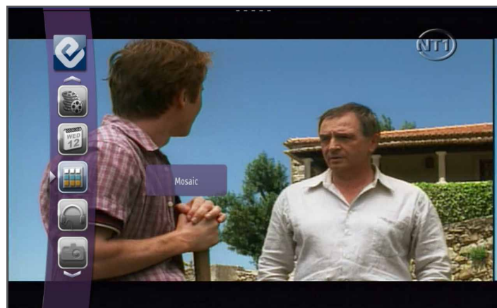
Figure 5: A menu portal provides quick access to user services, such as Mosaic, EPG and content library.