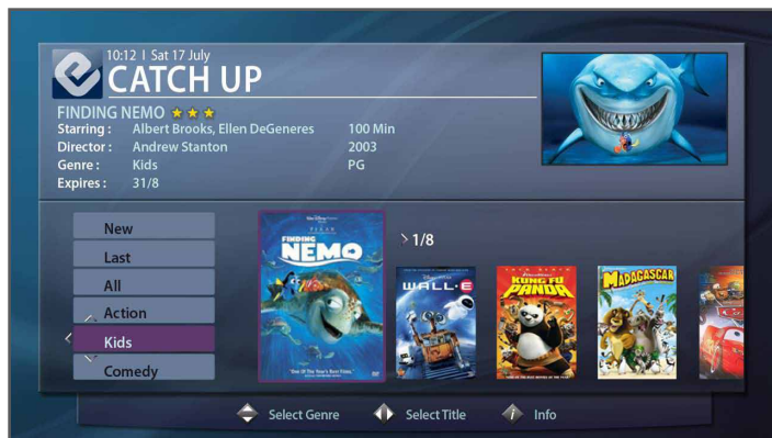
Figure 6: Content in the on-demand catalog is organized by a variety of attributes, such as channels, genres and “top 10 lists”, enabling consumers to easily find content of interest.

Operators can bundle content in any way and on the fly to support various business models, including pay per view, event packages or subscriptions, without having to re-encrypt the content.