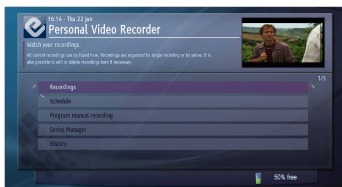
Figure 4: Subscribers can easily organize, edit and view recorded content.