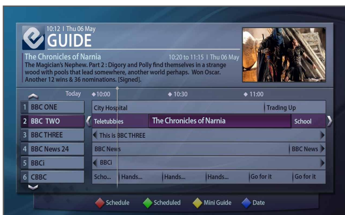
Figure 1: Customized EPG with localized languages and time zones provides detailed program information and enhances subscribers' viewing and navigation experience.