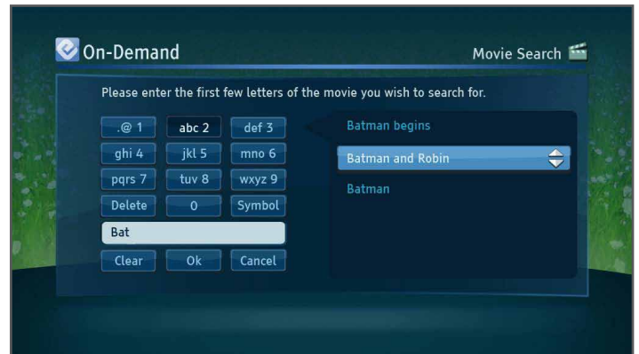
Figure 7: "Search and suggest" allows consumers to enter a partial name of a program or movie and see all potential matches.

The solution includes a powerful content management system for on-demand video assets to manage the full life cycle of content distribution, including ingestion, transcoding, publishing/workflow management, business policies and detailed usage reporting. It enables content rights owners to easily distribute video content to other platforms, such as to computers and mobile devices. Video assets are automatically transcoded to the appropriate format (e.g. MPEG-2/H264, MPEG-4, VC-1, Flash, or 3GPP) and protected using the appropriate DRM technology. The Irdeto content management system makes it easy to turn a web site into a premium video portal using any web development technologies including HTML, Adobe Flash and Microsoft SilverLight.