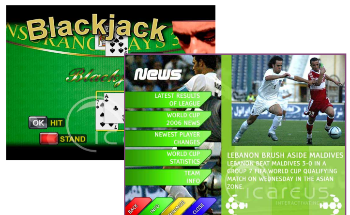
Figure 2: Third-party applications can be easily added to the Irdeto SmartStart solution to offer popular services such as games, news and weather.